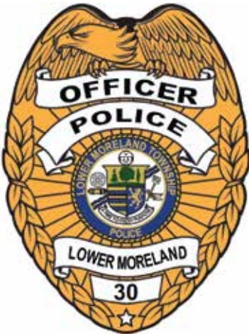
STEP 1. VECTOR ART