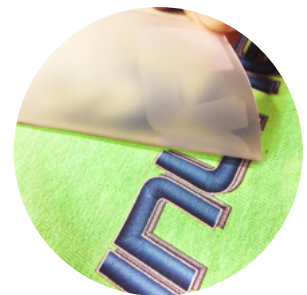
PENNTTRANS® HEAT TRANSFER

Leather emblems are a timeless, classic, rustic addition for all garments. The sleek, smooth texture provides an edgy appearance while the warm, earthy colors add dimension and style.