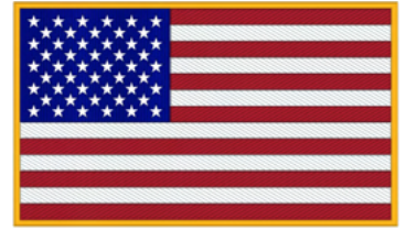
Gold Classic MATTE: PV2849068 METALLIC: PV2849085