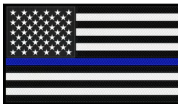
Blue Stripe MATTE: PV2852433 METALLIC: PV2852432