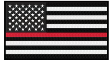
Red Stripe MATTE: PV2852435 METALLIC: PV2852434