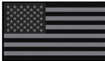
Black MATTE: PV2845786