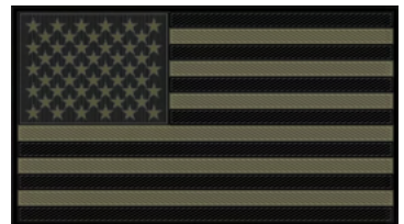
Olive MATTE: PV2829985