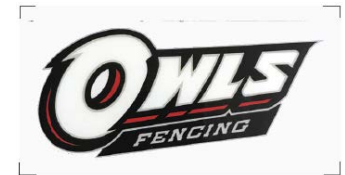
PENNTTRANS® HEAT TRANSFER

Tackle Twill emblems have multiple layers of fabric with elaborate stitching to deliver a three-dimensional effect. They can be customized with a variety of layered textures.