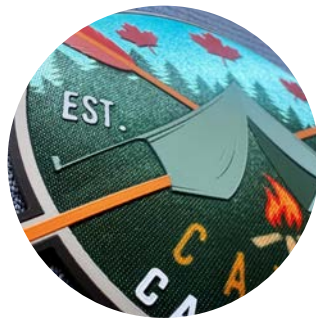
PRINTED ON FABRIC