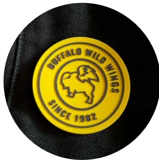
MOLDED PATCH (ONE PIECE)