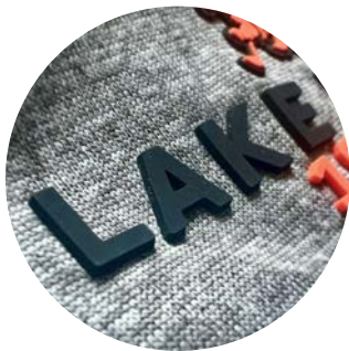
MOLDED APPLIQUE (SEPARATED ELEMENTS)

Silicone Emblems and Transfers are one of the most trending design techniques of the decade. These 3D, flexible, smooth emblems are durable in harsh conditions and never fade over time. The variety of silicone techniques shown below make silicone emblems a modern and unique addition to apparel, bags, shoes, promotional swag and more!